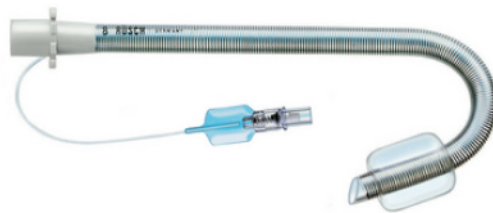
Laryngoflex Teleflex.com 1-(866) 246-6990

If I require intubation the preferred device is the “Laryngoflex.”