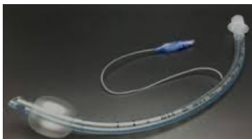
Cuffed endotracheal tube

If not available, a standard cuffed endotracheal tube of the correct diameter should be inserted into my neck stoma.